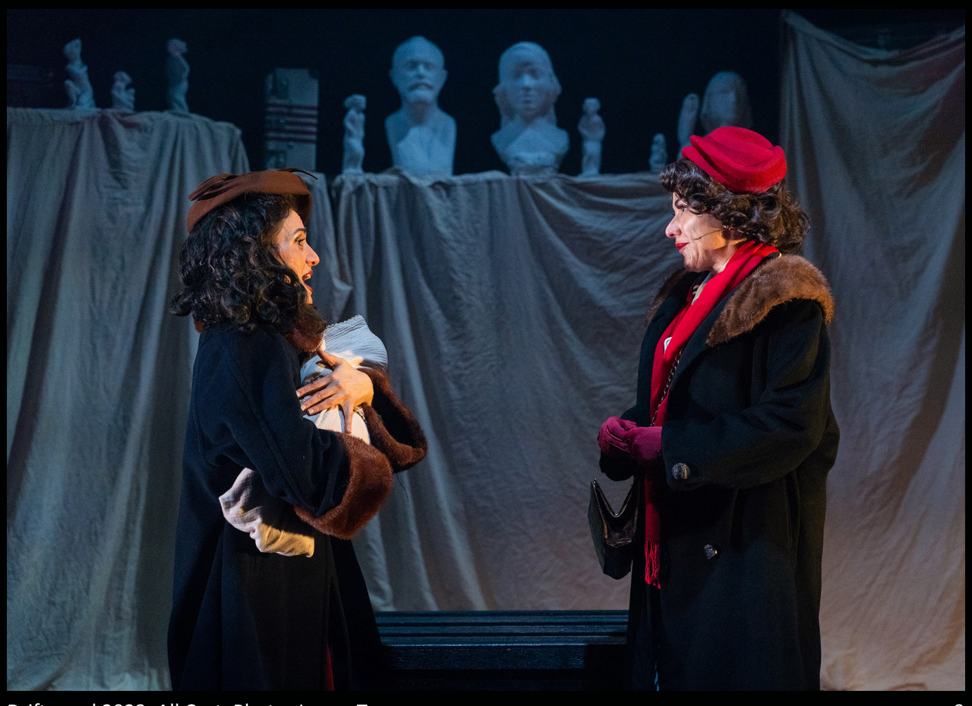
Driftwood 2023, All Cast.