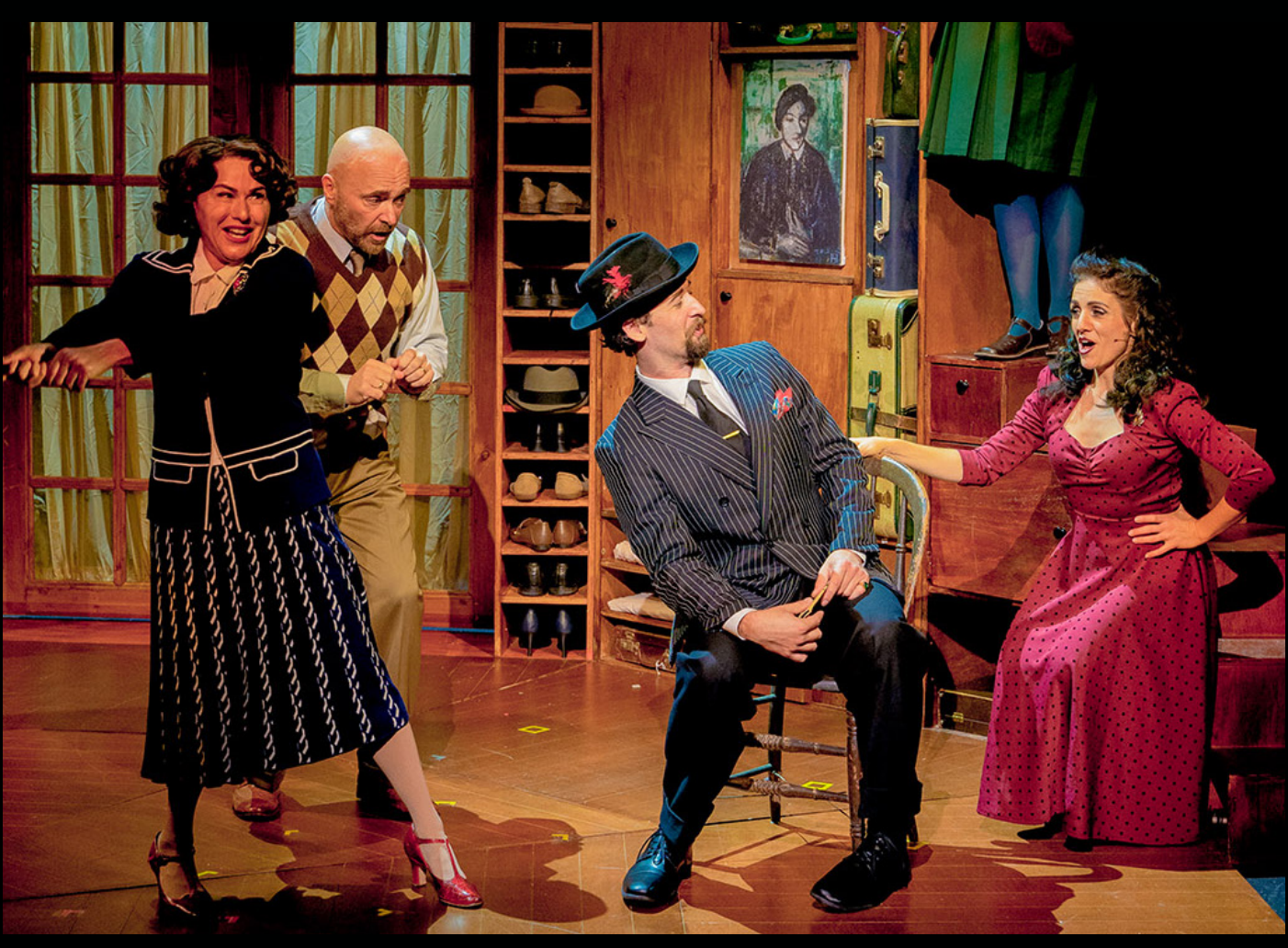
Driftwood 2023, All Cast.